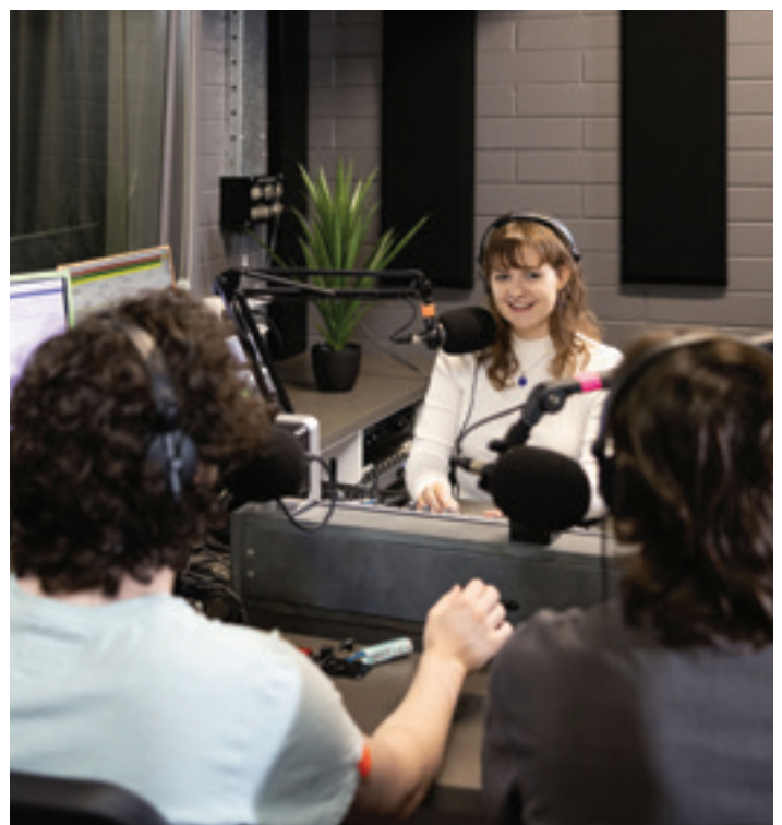
Film and TV studio (top) and digital radio studio

You'll have access to contemporary, industry-standard digital radio studio facilities at our Magill Campus with our student-operated station, UniCast, broadcasting online 24/7. Gain hands-on experience in presenting and producing in a supportive environment as you learn to use commercial-grade radio hardware and software. Become a UniCast volunteer to further your radio experience, an opportunity open to all Adelaide University students. Or, be part of Adelaide University Student Radio, the oldest student-run radio program in Australia, broadcasting on Radio Adelaide.