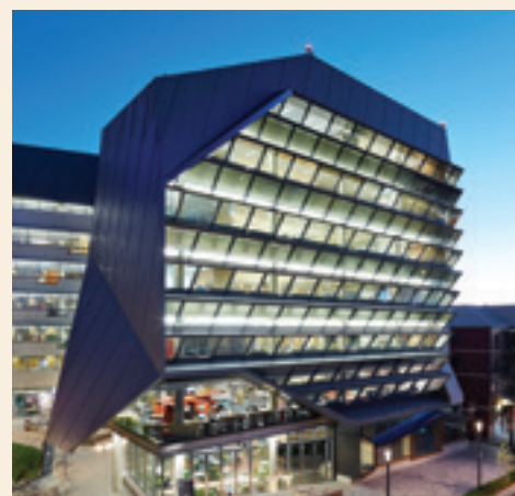
Adelaide City Campus