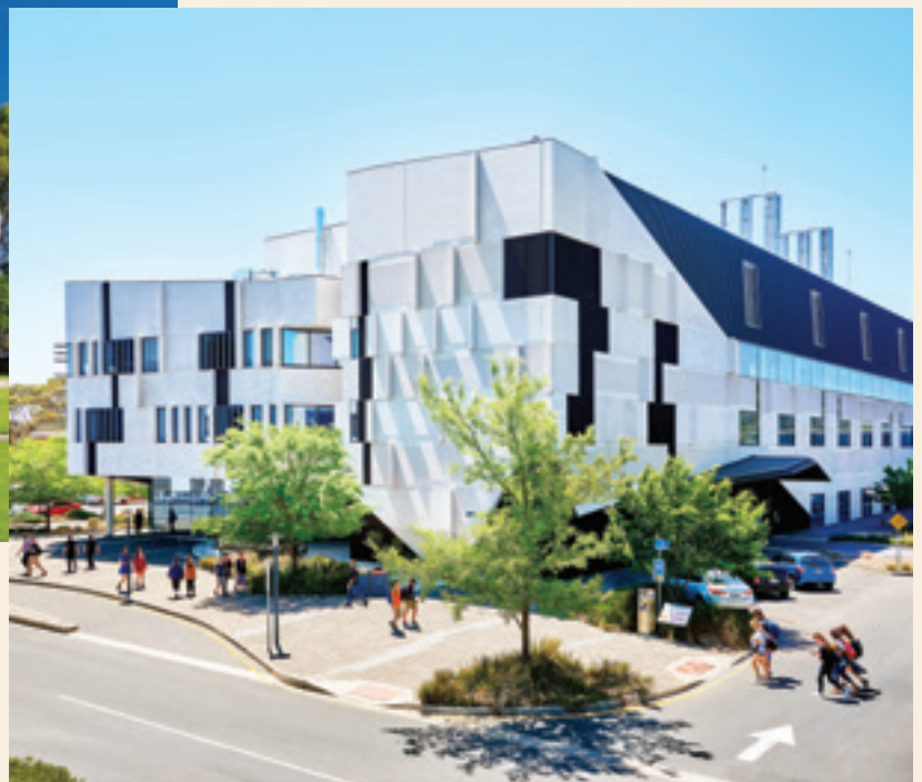
Mawson Lakes Campus