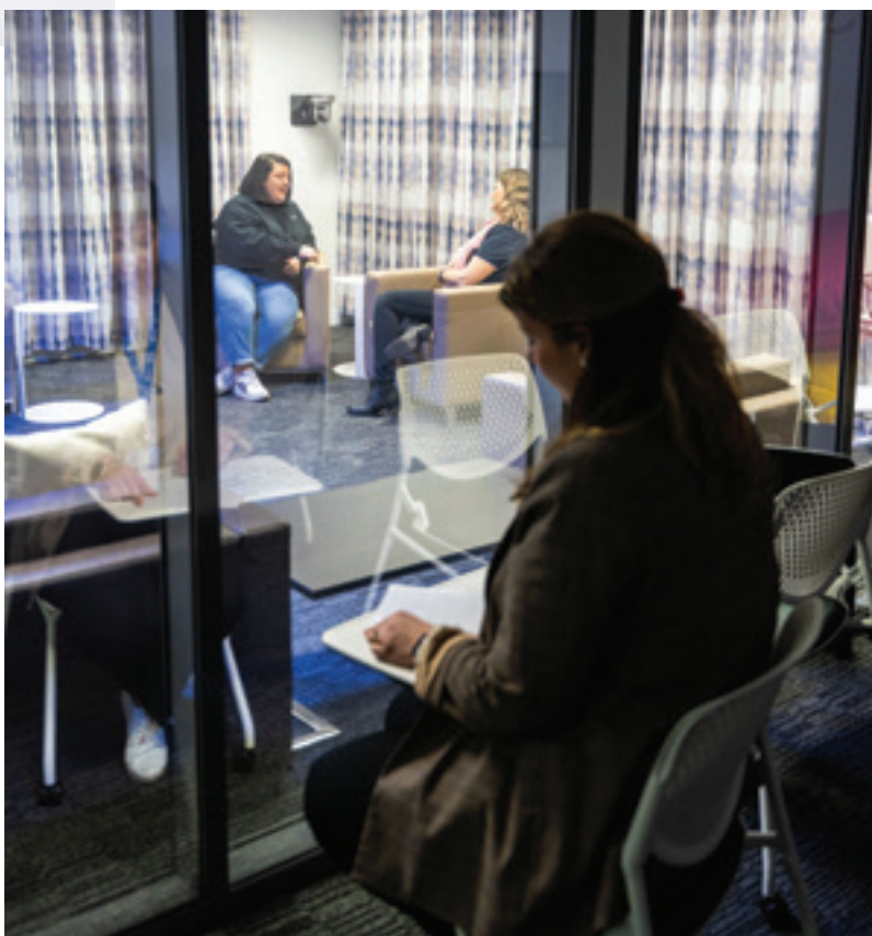
Mount Gambier social work studios

Adelaide University has custom-built social work studios at both Magill and Mount Gambier campuses. Equipped with cameras, recording equipment and two-way mirrors, you'll be able to observe simulated scenarios and learn through self-reflection. Supported by field practitioners and academic staff, you'll gain practical interviewing and consultation skills to strengthen your professional practice.