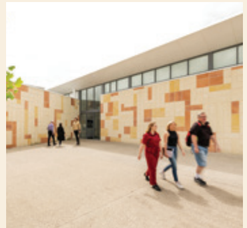
Mount Gambier Campus

You'll never be far from your next class with affordable on campus student accommodation at Whyalla, while city loop buses will get you around Mount Gambier with ease. Our Adelaide City, Mawson Lakes and Magill campuses are easily accessed by public transport. In addition, our Magill Campus can be reached by bus or car with plenty of affordable on campus parking available.