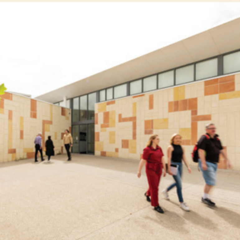
Mount Gambier Campus