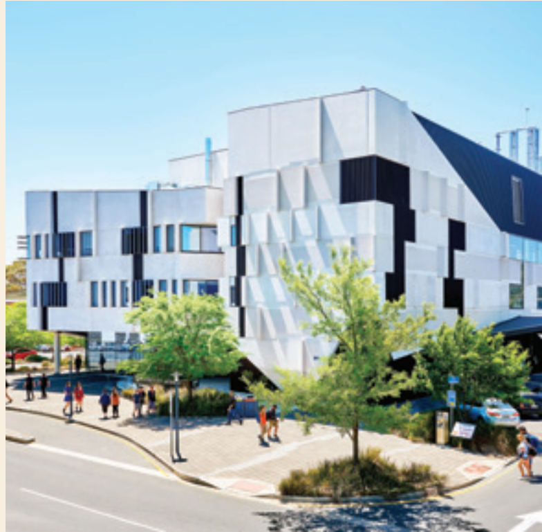
Mawson Lakes Campus